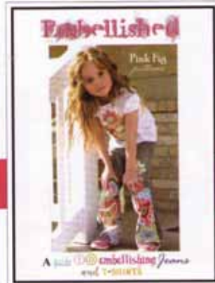
Top to bottom: "Little Lounge Around" and "Little Sleep Well," Favorite Things Pattern Designs; "Claire," Portabellopie Boutique Patterns; "Playdate Dress," and "Sandbox Part & Starfish Stencil," oliver + s; "Little Charmers," Indigo Junction; "Seat Cover, Bag & Pad," Kwik•Sew Pattern Co.; "Milk & Cookies," Fig Tree Quilts; "Posie," Fig Tree Quilts; "Embellished," Pink Fig